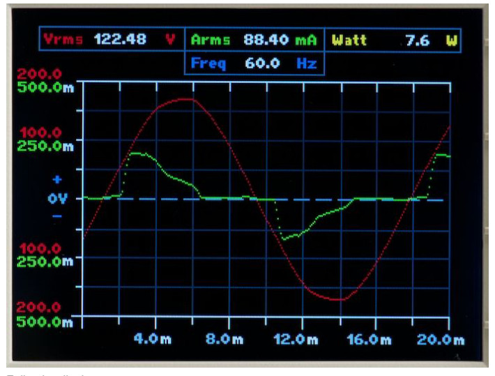
Full color display

The color graphics display on the PA1000 is unmatched among single-phase power analyzers. It provides intuitive readout of not only measurement values, but also harmonic bar charts, waveform display, energy integration plots and more. Setup of the PA1000 for your particular application is also easy and flexible, using the menu-driven interface and soft keys.