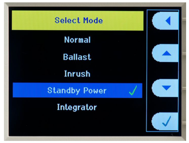
Selection of application-specific test modes

Some applications require special instrument settings to ensure proper measurements. The PA1000 simplifies setup for these applications by automatically choosing instrument settings and parameters that are optimized for each type of measurement application, resulting in more reliable measurement results with less opportunity for user setup error.