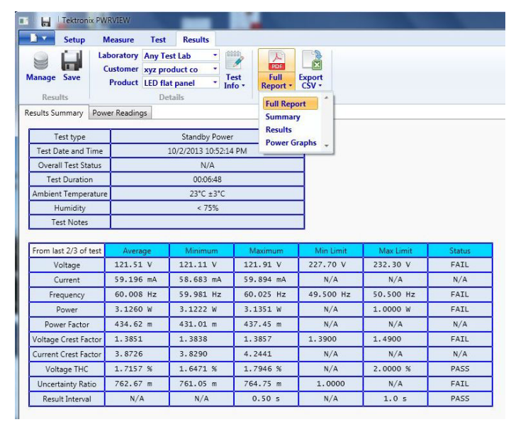
Full test results report